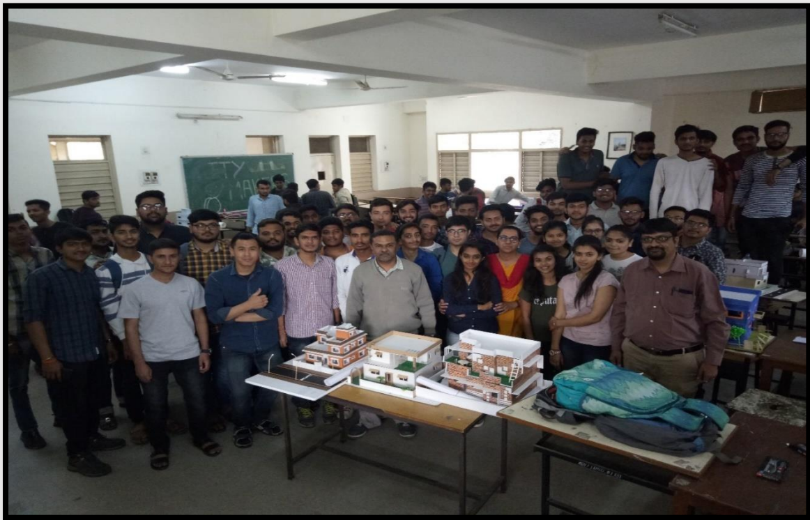
BUILDING AND TOWN PLANNING MODEL MAKING COMPETITION