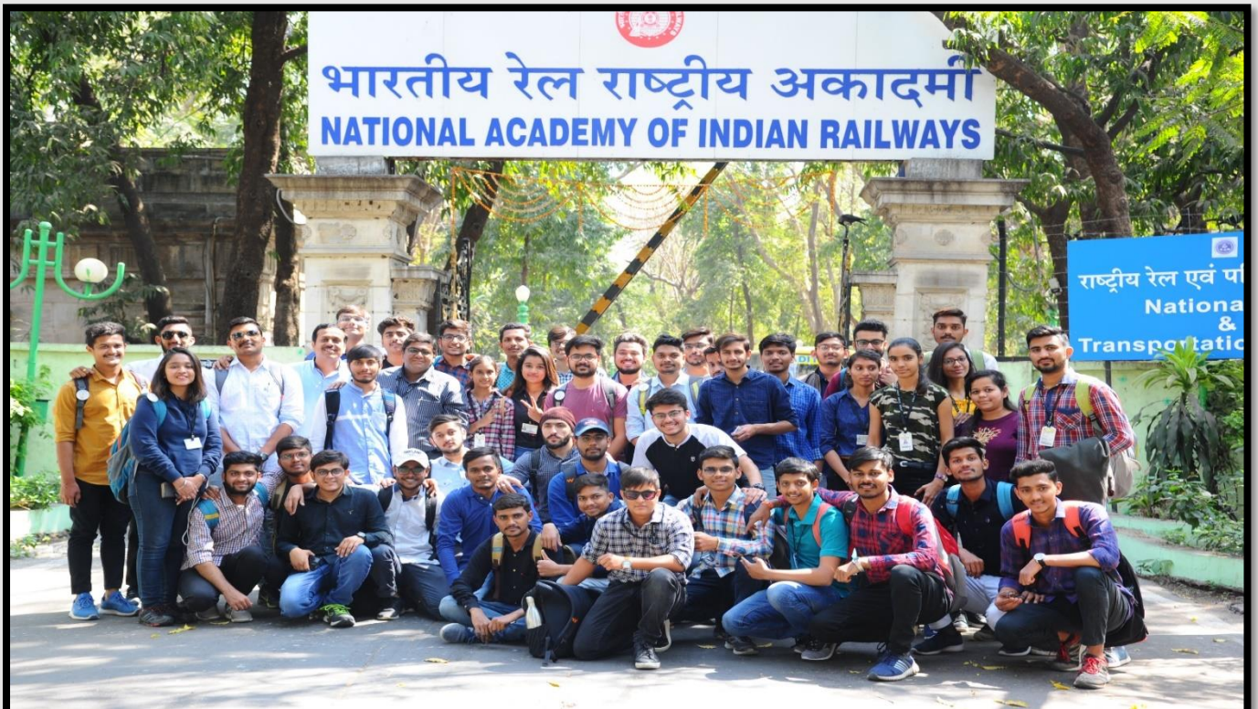
3 RD YEAR BATCH