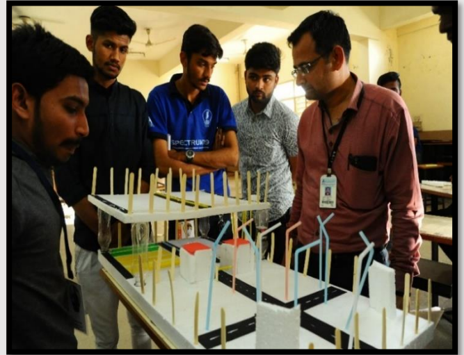
TECHNICAL ACTIVITY: WASTRASOL