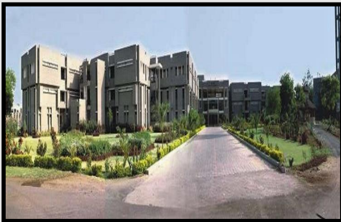
AERIAL VIEW OF ADIT