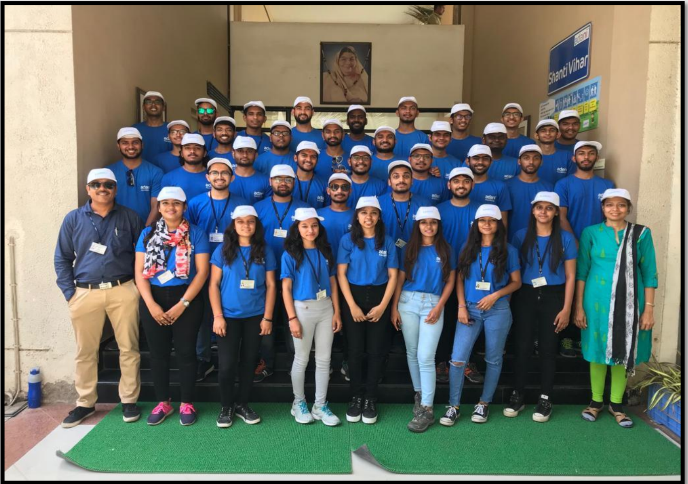
4 TH YEAR BATCH