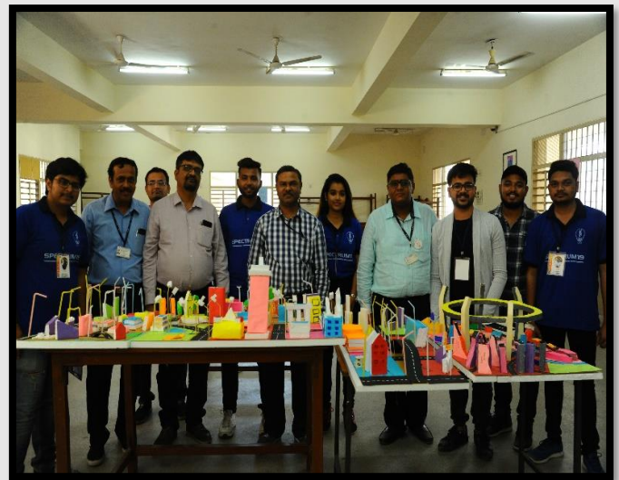
TECHNICAL ACTIVITY: CITY MAKERS