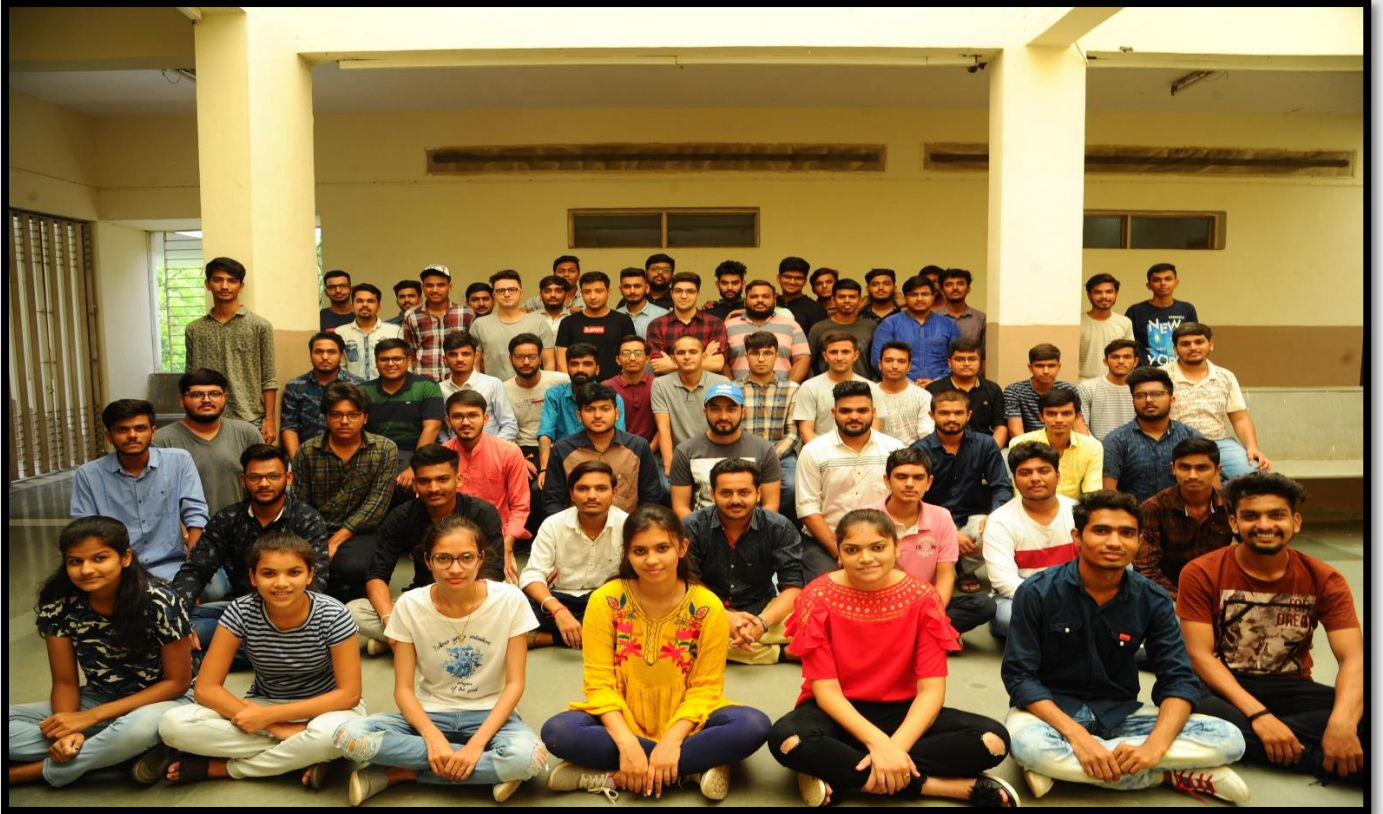
2 ND YEAR BATCH