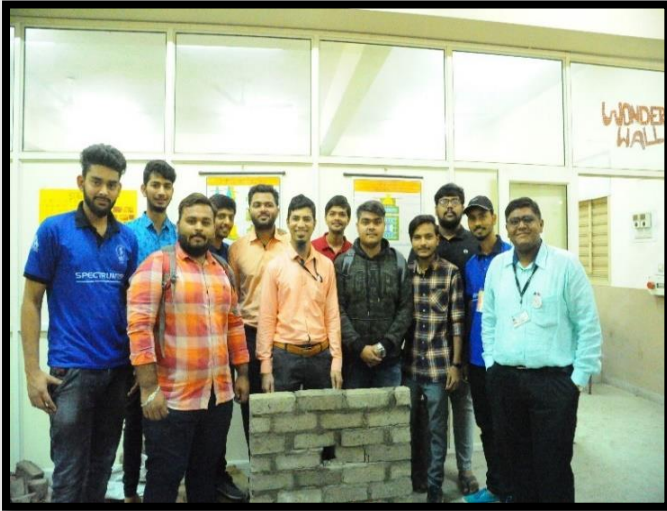
TECHNICAL ACTIVITY: WONDER WALL