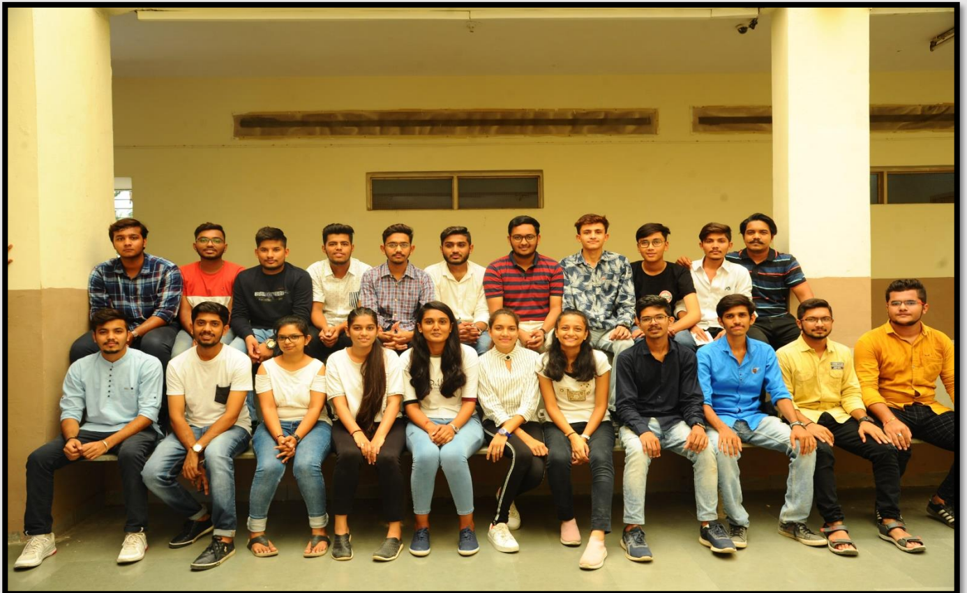
1 ST YEAR BATCH