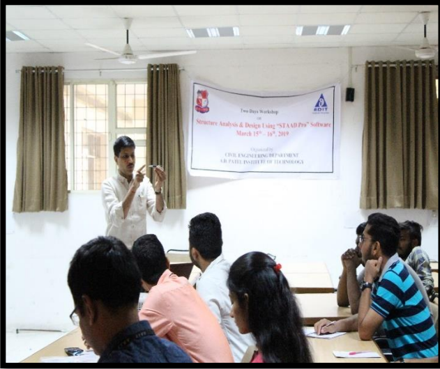
STAAD PRO SOFTWARE EXPERT LECTURE