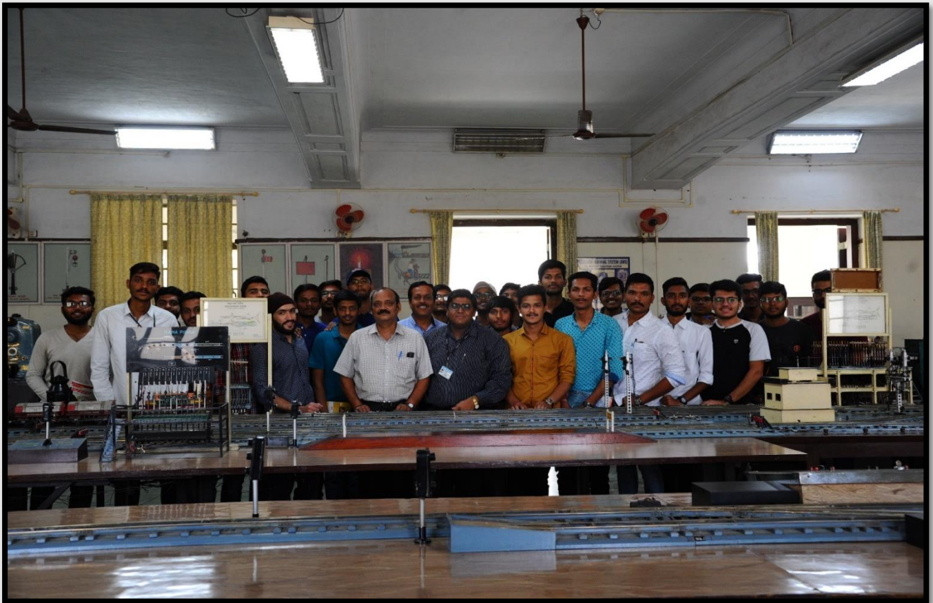
RAILWAY ACADEMY BARODA VISIT (3 RD YEAR)