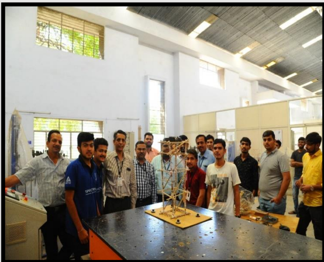
TECHNICAL ACTIVITY: SEISMIC TOWER